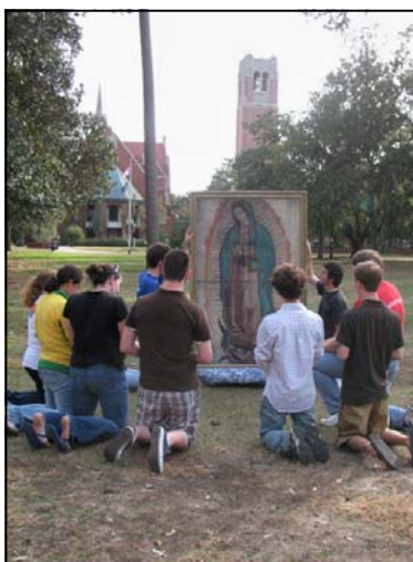
University of Florida students venerate their merciful Mother in the Missionary Image.

Jesus told St. Faustina Kowalska of Poland that He desired the Church to establish a Feast of Divine Mercy on the Sunday after Easter. He said, “I desire that the Feast of Mercy be a refuge and shelter for all souls, and especially for poor sinners. On that day the very depths of My tender mercy are open. I pour out a whole ocean of graces upon those souls who approach the fountain of My mercy. The soul that will go to Confession and receive Holy Communion shall obtain complete forgiveness of sins and punishment. On that day all the Divine floodgates through which graces flow are opened.”