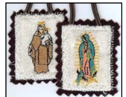
Brown Scapular of Our Lady of Mt. Carmel

Brown Scapulars consist of two small squares of woolen cloth joined by strings and worn around the neck. (See the photo below). The original, large scapulars worn by the Carmelites were work habits that came to symbolize the Cross and yoke of Christ.