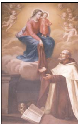
Our Lady holding out the Brown Scapular to St. Simon Stock.

By saying, “this habit,” Our Lady meant the brown woolen scapular clothing of the Carmelite Order. Our Lady herself appeared to St. Simon Stock accompanied by a multitude of angels and held this scapular in her hand. Her promise has been extended to all those enrolled in the Brown Scapular. Obviously, simply wearing this Scapular does not save us, as if by magic. Jesus saves us through living our total consecration to Him. The Brown Scapular is a sign of our consecration.