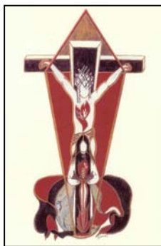
Our Lady Mediatrix of All Grace clothed in the Brown Scapular.

Jesus King of All Nations revealed a special Consecration to Himself through Our Lady Mediatrix of All Grace. He also revealed an image of Himself on the Cross as the Mediator of our salvation with Our Lady as Mediatrix of All Grace standing at the foot of the Cross. She is clothed with the Brown Scapular that encircles the world. (See the image at right).