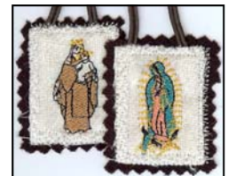
Brown Scapular of Our Lady of Mt. Carmel

Brown Scapulars consist of two small squares of woolen cloth joined by strings and worn around the neck. (See the photo below). The original, large scapulars worn by the Carmelites were work habits that came to symbolize the Cross and yoke of Christ.